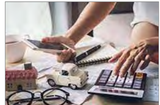
Economic crisis hits hard Sri Lankan households

The economic crisis is bearing on people with as many as 60.5 percent of households finding their monthly average incomes reduced, according to a survey by the Department of Census and Statistics.