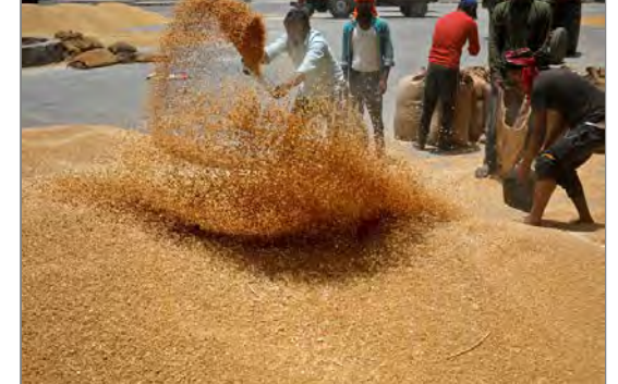
Global 2024 staple food supplies to be strained

High food prices in recent years have prompted farmers worldwide to plant more cereals and oilseeds, but consumers are set to face tighter supplies well into 2024, amid adverse El Nino weather, export restrictions and higher biofuel mandates.