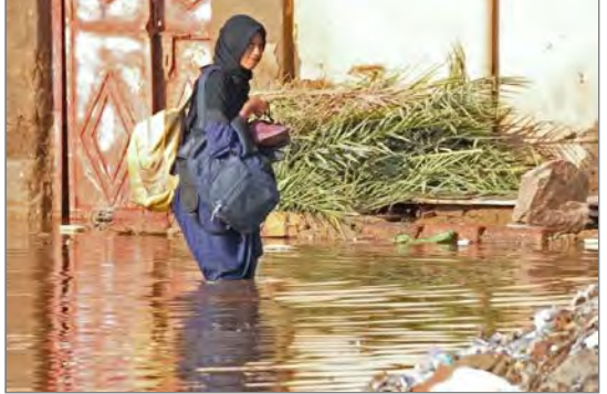
Poor countries win fight for climate cash at COP28

In a surprise that has lit up COP28, delegates have agreed to launch a long-awaited fund to pay for damage from climate-driven storms and drought. Three decades after the idea was first mooted, the 'loss and damage' cash agreement was greeted with sustained applause on the conference floor.