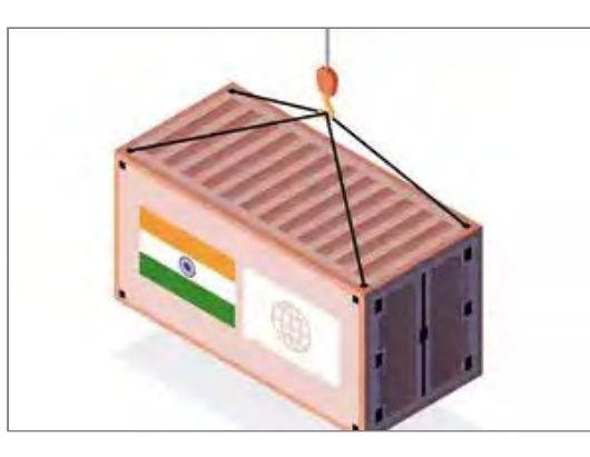
Indian trade curbs to cut exports by US$4bn