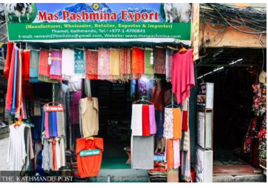
Nepali exports to US falling despite preferential treatment

The United States has granted trade preferential treatment to Nepal, but traders have not been able