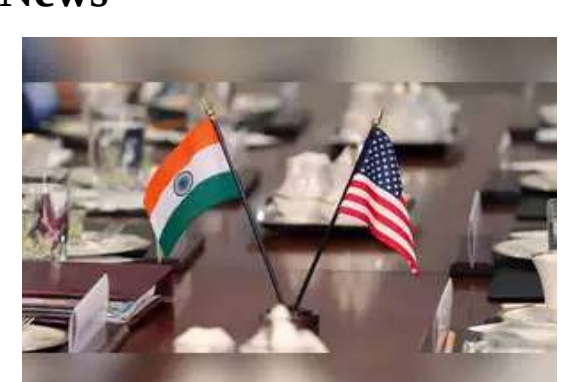
India, US mutually resolve all six trade disputes at WTO

India and the US have mutually resolved all six trade disputes pending at the World Trade Organisation (WTO), in line with the commitment made by the two countries during the US visit of Prime Minister Narendra Modi last month.