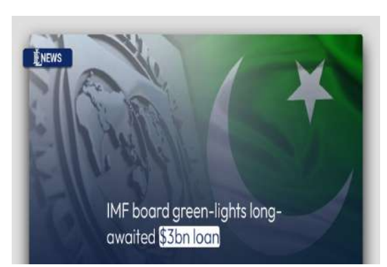
IMF board green-lights long-awaited $3bn loan

The International Monetary Fund (IMF) said that its executive board had approved a US$3bn loan agreement for Pakistan, unlocking crucial funding for the troubled economy.