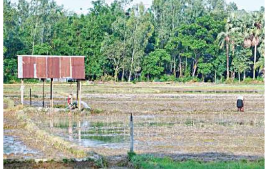
El Niño weighs on Bangladesh's agriculture

to benefit from it because they don't know how. Read More