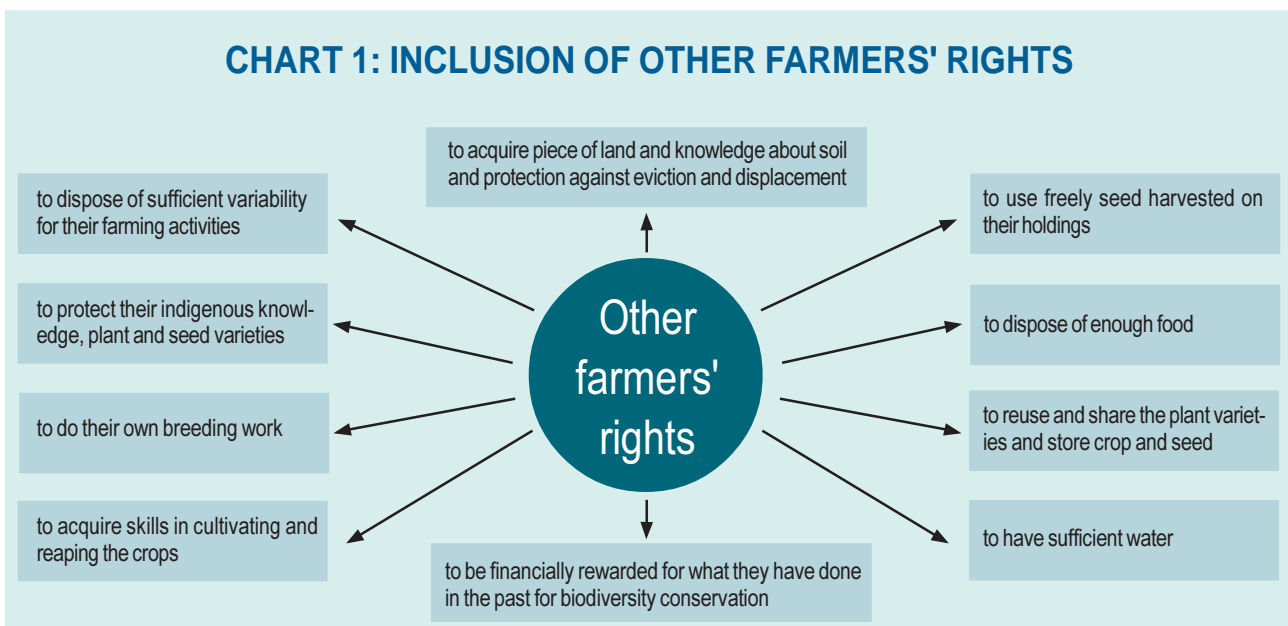
CHART 1: INCLUSION OF OTHER FARMERS' RIGHTS

The ITPGRFA has exclusively recognised the rights of the farmers to save, use, exchange and sell farm-saved seed/propagating material. In addition, three sets of rights have been recognised for the farmers